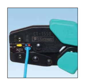
CONTOUR CRIMP™ Controlled Cycle Crimping Tools