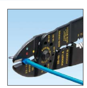
Plier Type Crimping Tools