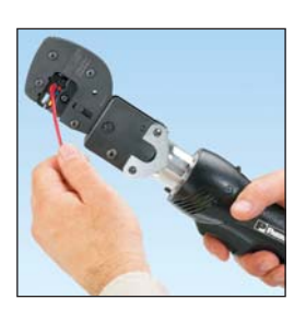
Battery Powered Crimping Tool CT-2500