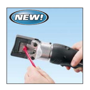
Battery Powered Hydraulic Crimping Tool CT-2600